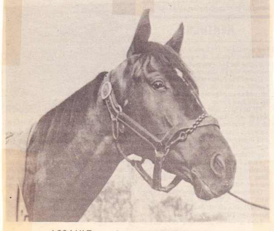
ASSAULT-Triple Crown champion in 1946.

"Aside from the great enthusiasm Texans have for the horse, Texas thoroughbred racing is destined to be successful, based on the large population alone. I'm real excited about all of it—all that's happened so far, and all that's going to happen soon."